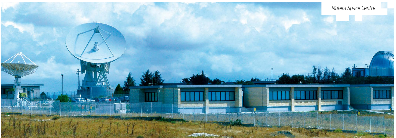
Matera Space Centre

The COSMO-SkyMed programme will move forward in the near future with the development of two second generation satellites with improved performance.