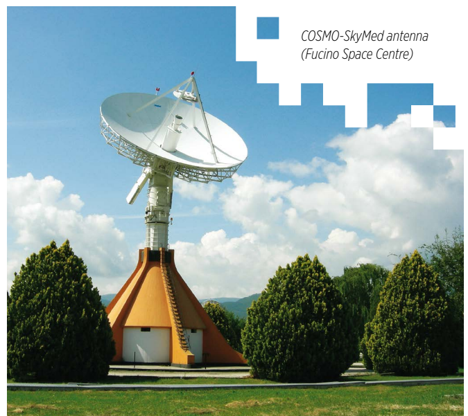
COSMO-SkyMed antenna (Fucino Space Centre)

COSMO-SkyMed was conceived as a programme capable of meeting civil needs (environmental monitoring, civil protection, Oil & Gas) as well as military ones. The general features enable interoperability with other systems and the use in the context of international agreements. In particular, COSMO-SkyMed is able to meet the stringent operating requirements of Copernicus, the European programme for Earth observation.