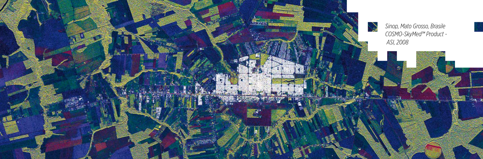
Sinop, Mato Grosso, Brasile COSMO-SkyMed™ Product - ASI, 2008