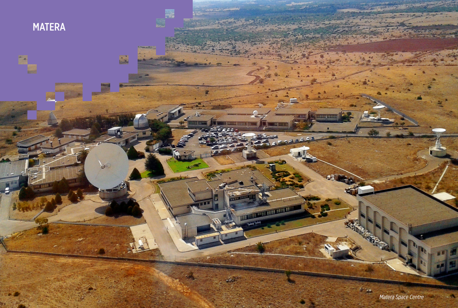
Matera Space Centre