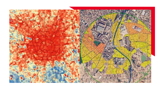
WEBPORTAL - APP MOBILE - ESRI BASED TOOL

Keeping track of the surroundings of an infrastructure can be vital to guarantee safe operations. AWARE provides multitemporal analysis based on optical/radar satellite, aerial and drone data to identify changes in the territory: vegetation along railways or toxic dumps close to aqueducts are just a couple of AWARE's basic services.