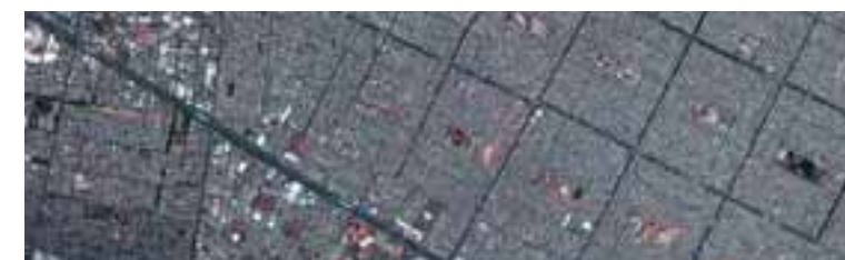
Mexico City, Mexico 19° 23' N, 99° 01' E www.telespazio.com/calendar/mexicocity.html

Special thanks to DigitalGlobe and TerraColor for their contribution to the project.