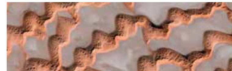
Rub' al-khali desert, Saudi Arabia 21° 57' N, 55° 16' E www.telespazio.com/calendar/rubalkhali.html