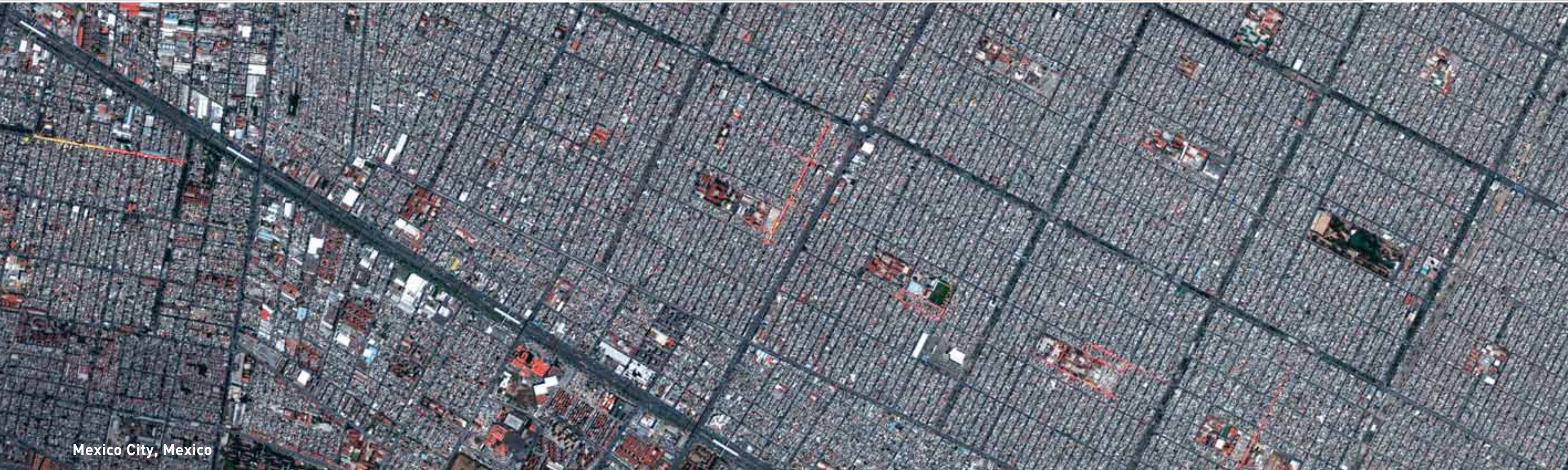
Mexico City, Mexico

In 2007, the world urban population will exceed the rural population, for the first time in history.