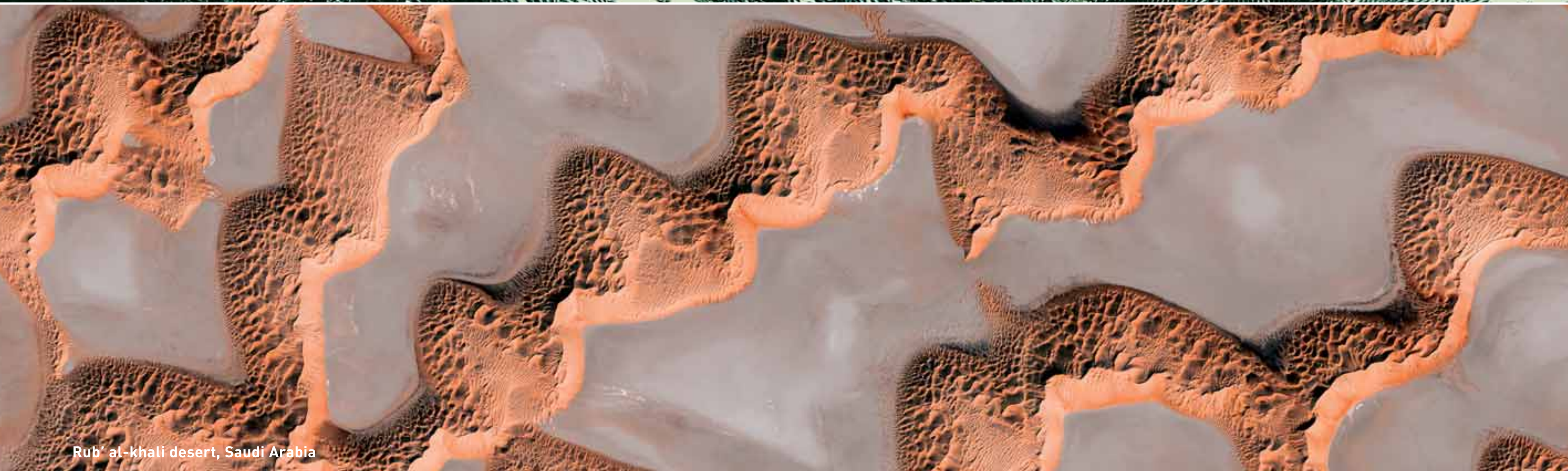
Rub' al-khali desert, Saudi Arabia

Every year around six million hectares (double the area of Belgium) undergo a process of irreversible desertification.