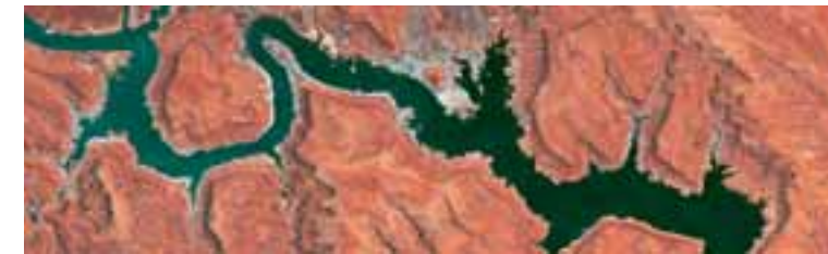
Colorado river, Utah, USA 37° 43' N, 110° 27' W www.telespazio.com/calendar/colorado.html © DigitalGlobe