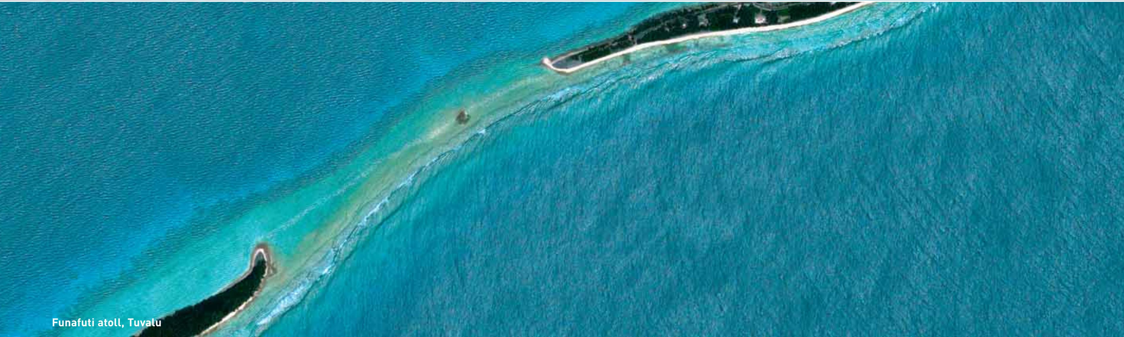
Funafuti atoll, Tuvalu

Because of sea levels rise, the Tuvalu archipelago in the Pacific Ocean could be under water by the end of this century.