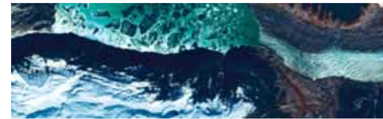
Gilkey glacier, Alaska, USA 58° 46' N, 134° 36' W www.telespazio.com/calendar/gilkey.html

Telespazio, a Finmeccanica / Alcatel company, is one of the world's leading operators in satellite services. A cutting-edge partner in a changing world, engaged in a range of activities including satellite navigation, broadband multimedia telecommunications, Earth observation, satellite and control centre management. Telespazio dedicates its experience and resources to make Space a place more accessible to the grand projects of Man. Telespazio, with its headquarters in Italy, is also present in France and Germany, and has space centres and operational sites around the world.