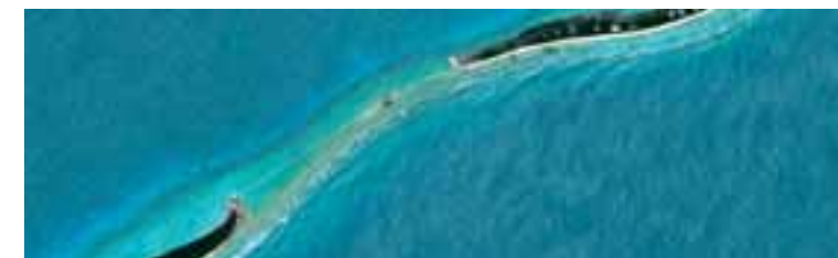
Funafuti atoll, Tuvalu 8° 33' S, 179° 10' E www.telespazio.com/calendar/funafuti.html © DigitalGlobe