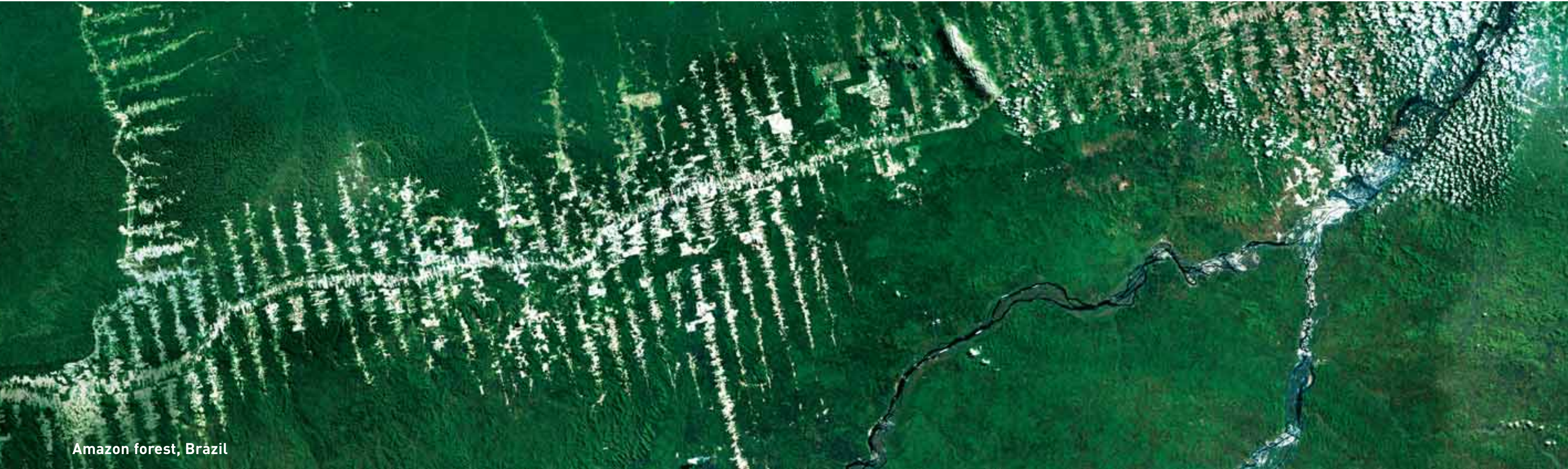
Amazon forest, Brazil

An area of rainforest the size of a football field is being destroyed each second.