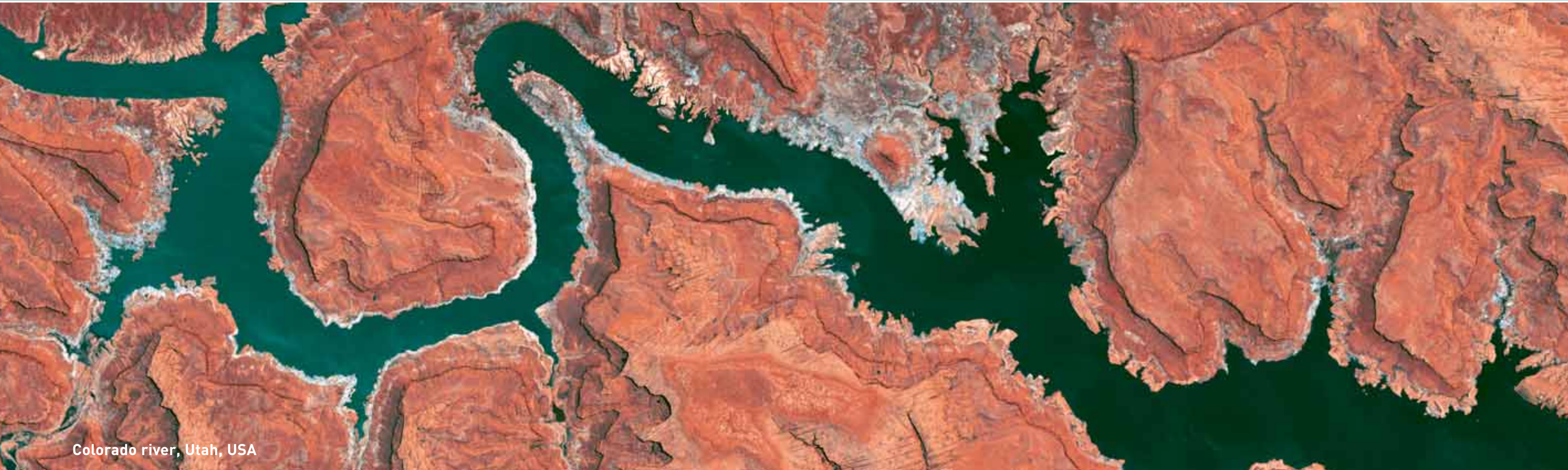
Colorado river, Utah, USA

Man's use of water has reduced the flow of many large rivers to such an extent that they often run dry before reaching the sea.