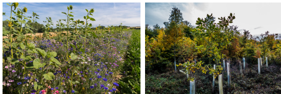
Monitoring of biodiversity and compensation