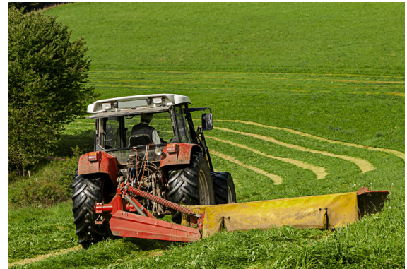
Mowing detection and determination of cutting frequency